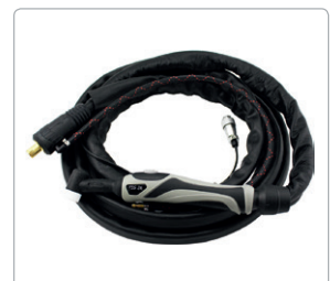
Includes 4m WP26 TIG torch