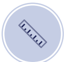
5mm Max Weld