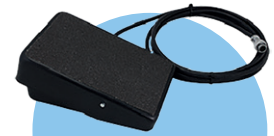
OPTIONAL USA MADE SSC FOOT PEDAL